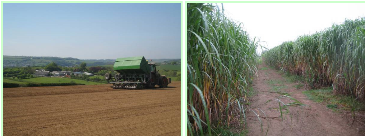
Left: Miscanthus being planted at Tredethick Farm in May 2012.

The district heating scheme requires around 340,000 kilowatt hours (kWh) of heating per year. From 2015 onwards this will be provided from just 5.7 hectares of miscanthus that was planted on the farm in May 2012. An establishment grant providing 50% towards the cost of planting was awarded by the Energy Crops Scheme (ECS) managed by Natural England. Until the crop reaches maturity, miscanthus chip will be purchased from an existing local grower.