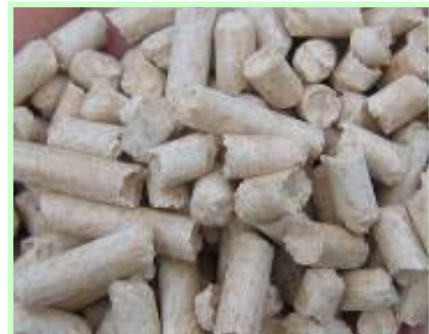
Wood pellets made from compressed sawdust.

Folly Farm has signed up for an annual maintenance contract with the installer. Automatic ash removal was an optional extra with this boiler but was not installed. Instead, the weekly activity of manual de-ashing is carried out by one of the farm's large volunteer network. Each week about half a wheelbarrow of ash is removed from the trays at the bottom of the boiler. Other routine tasks include vacuuming out the boiler house and cleaning the boiler tubes using pipe cleaners that were supplied with the boiler.