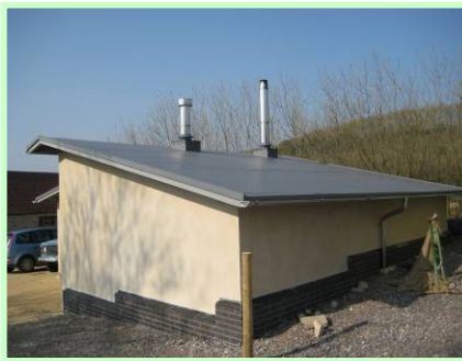
The boiler house. The right hand flue comes from the pellet boiler (the left hand flue comes from the LPG back up).

The table above suggests that pellets are likely to be cheaper than oil and LPG. Many businesses and community buildings in Mendip AONB are heated with these fossil fuels so pellets may enable a reduction in their heating bills. The price of oil has risen dramatically in recent years reaching up to 70 pence per litre in the summer of 2008. Prices of oil fluctuate considerably but the long term forecast is for prices to remain high.