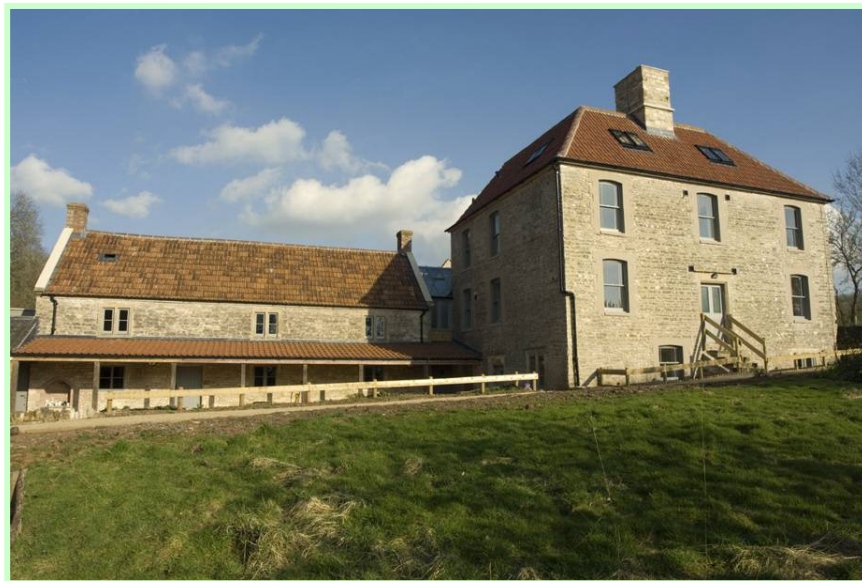
The Folly Farm Centre.

Folly Farm is an environmental learning centre based near Chew Valley Lake which is owned and managed by the Avon Wildlife Trust. The farmhouse and outbuildings date from the late 17th to early 20th century and underwent a complete redevelopment between 2006 and 2008. This major renovation was supported by the Heritage Lottery Fund, Biffaward and the South West Regional Development Agency (SWRDA). The centre now provides residential accommodation, restaurant facilities, workshops, meeting rooms and teaching facilities. The farm comprises a 250 acre nature reserve used for nature projects and teaching traditional skills; 60% of the reserve is woodland.